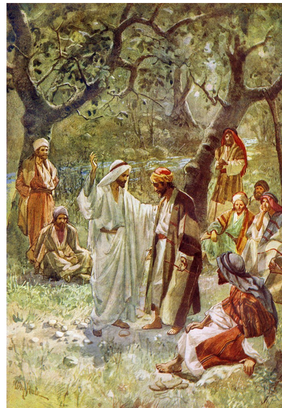
Peter's Faith in Christ by William Hole